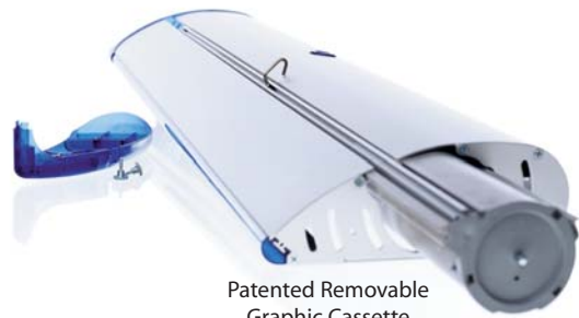
Patented Removable Graphic Cassette