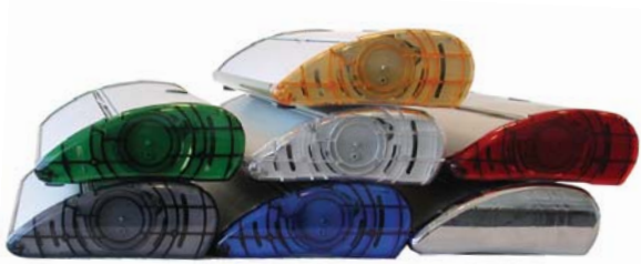
Seven different colored end caps: Amber, Green, Transparent, Red, Grey, Blue and Chrome.